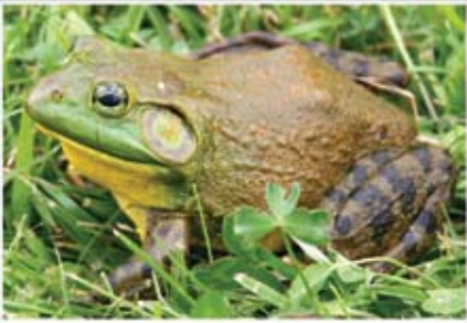
4 - bullfrog