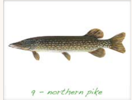
9 - northern pike