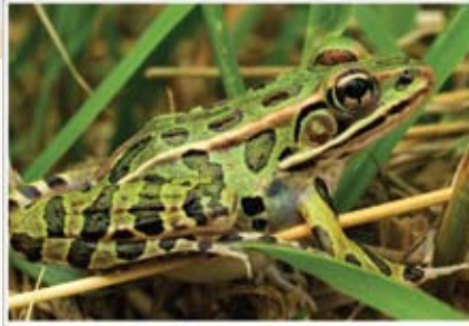
2 - leopard frog