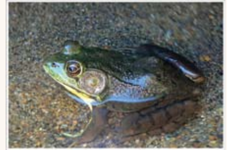
6 - green frog