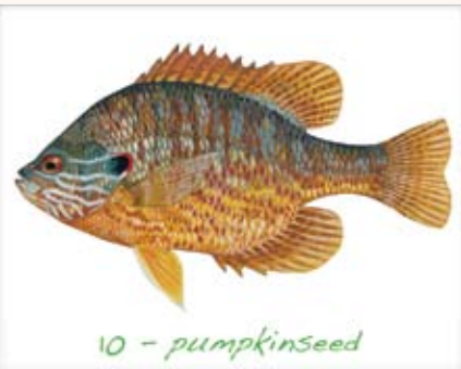
10 - pumpkinseed