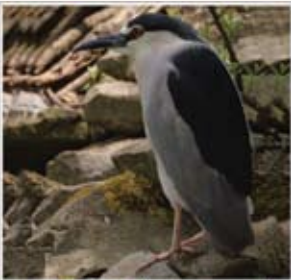
25 - black-crowned night-heron