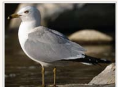
37 - ring-billed gull