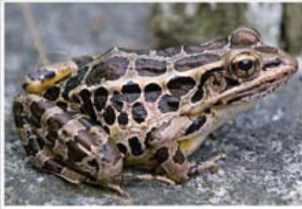
1 - pickerel frog