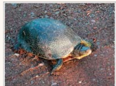
16 - Blanding's Turtle