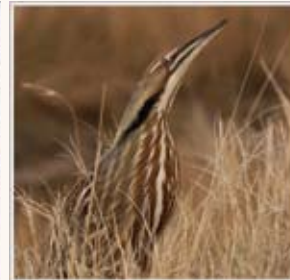
28 - American bittern