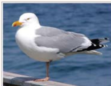
36 - herring gull