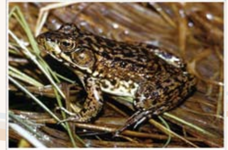
3 - mink frog