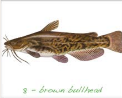
8 - brown bullhead