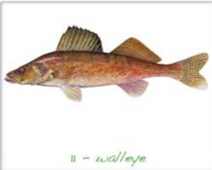
11 - walleye