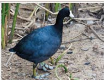
34 - American coot