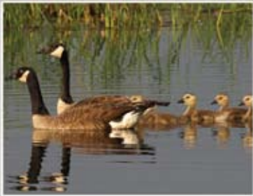
17 - Canada geese