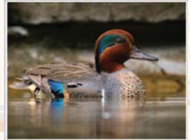
20 - blue-winged teal (male)