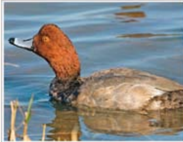
22 - redhead (male)