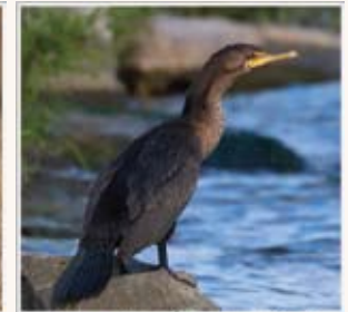
29 - double-crested cormorant