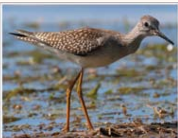
30 - greater yellowlegs