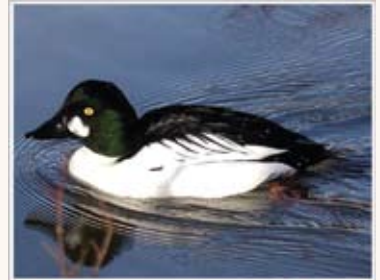
24 - common goldeneye (male)