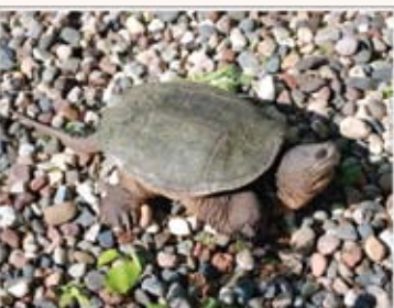
13 - snapping turtle