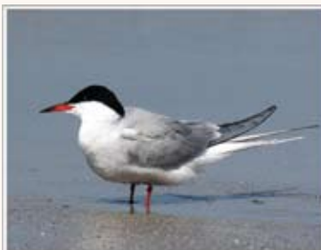
35 - common tern