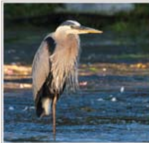
26 - great blue heron