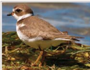
31 - semipalmated plover