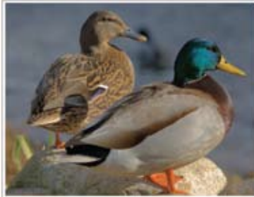
18 - mallard