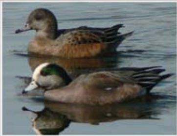
21 - American wigeon