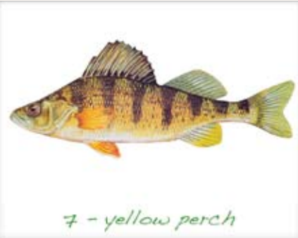
7 - yellow perch