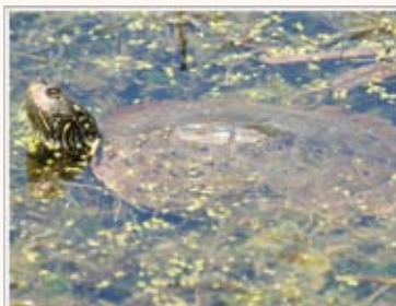
14 - map turtle