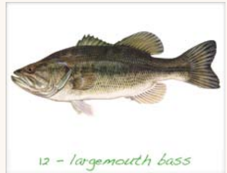
12 - largemouth bass