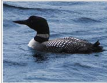
23 - great northern diver