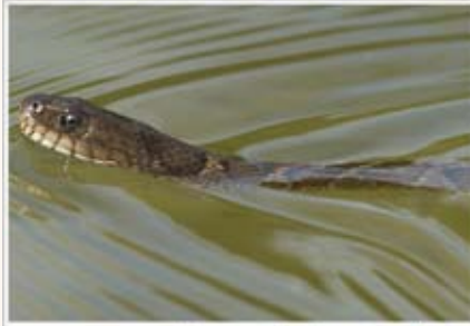
5 - northern watersnake