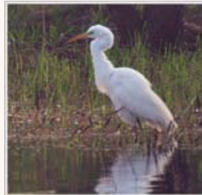
27 - great egret