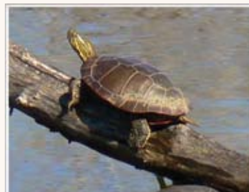
15 - painted turtle