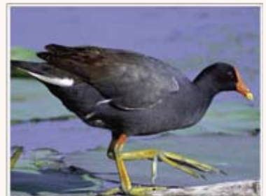
33 - common moorhen